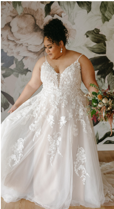
Allure Romance "3400"

Everyone has different silhouettes and we love how unique each and every one of our brides are! No matter your shape, an A-Line gown is universally flattering!