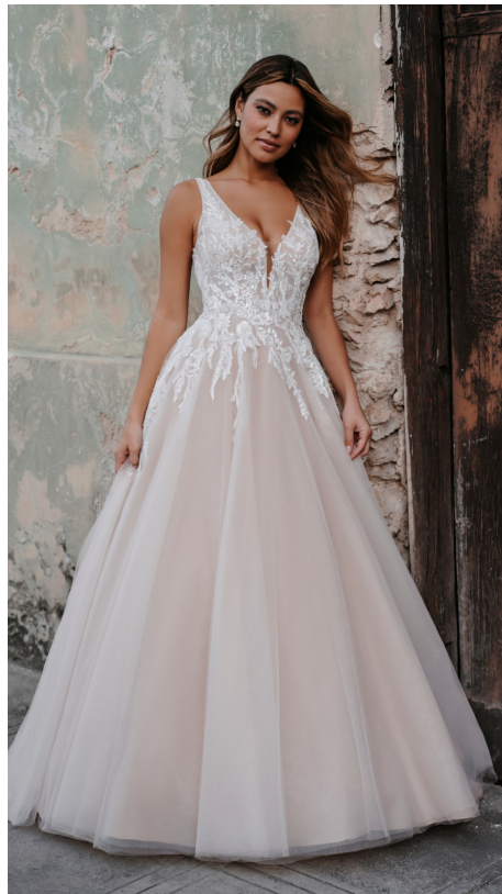
Allure Romance "3554"