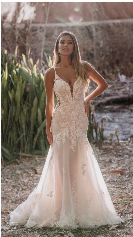
Allure Romance "3552"

Those who have an hourglass figure may have a fuller bust, smaller waist, and fuller hips.