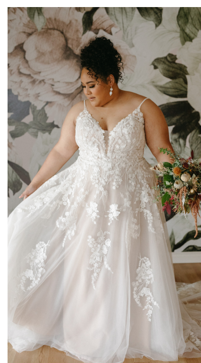
Allure Romance "3400"

Everyone has different silhouettes and we love how unique each and every one of our brides are! No matter your shape, an A-Line gown is universally flattering!