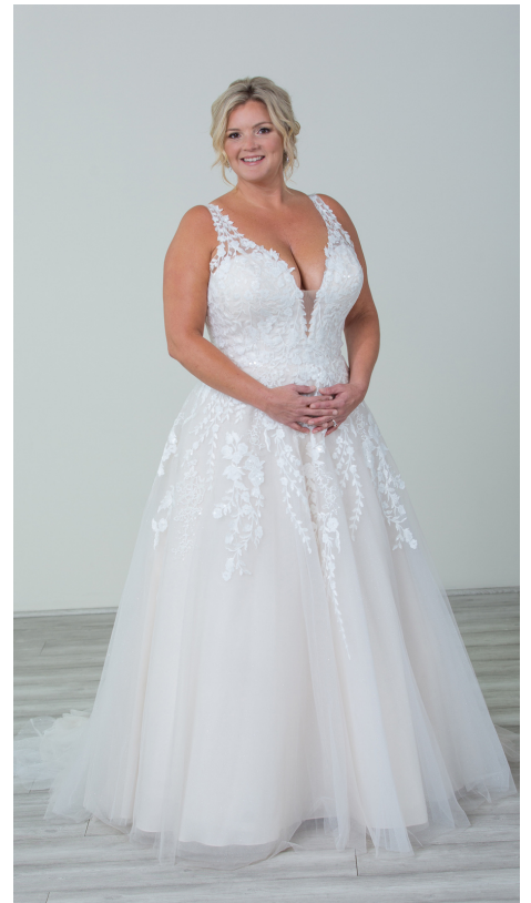
Allure Romance "3265"

We love a ball gown as it will help further accentuate your waist, and the fullness of the skirt of the gown will balance out your bust which will also give you a beautiful hourglass figure!