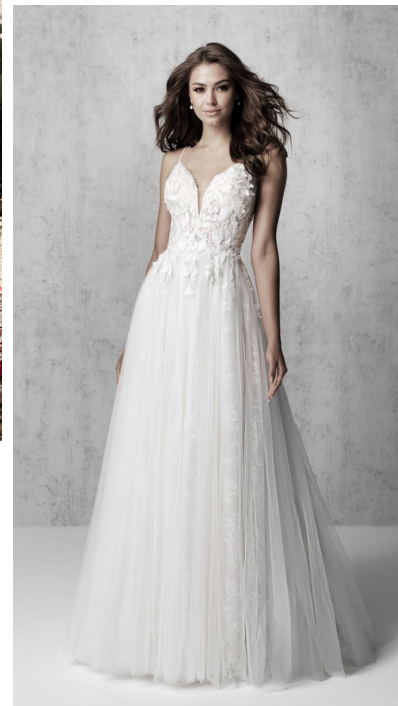
Madison James "MJ603"

The shape of an A-Line gown is fitted at the waist, highlighting your figure, and flows out, providing a bit of volume while not being overpowering to your figure!